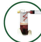
ACT-Cell Concentration Bone Marrow Aspirate (Mesenchymal Stem Cells)