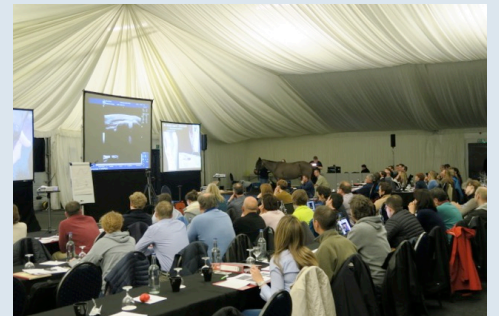
Pictured above and below are photos from the April 2016 UK Module, hosted by Bell Equine.

Orlando, Florida December 3 – 7 Booth 2729 info@iselp.org