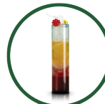
ACT-PRP Platelet-Buffy Coat Concentrate