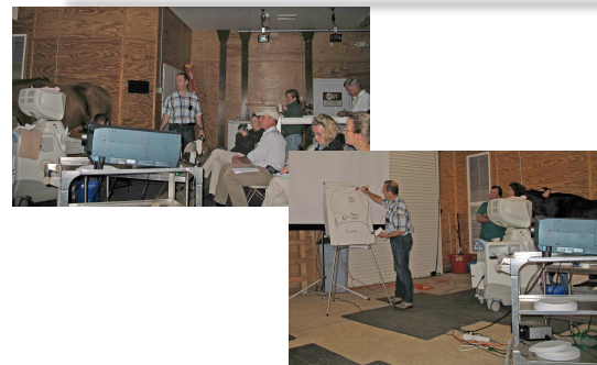
May 3, 2006, Virginia Equine Imaging hosting one of the First US Modules at Virginia Tech in Leesburg, VA.

Aria Boehringer Ingelheim Brightline Medical Ceva Dechra Epica Grand Circuit Products Hallmarq Veterinary Imaging Luitpold Animal Health Multi Radiance Medical Owl Manor Veterinary Platinum Performance Pulse Vet Sound Vetel Diagnostics