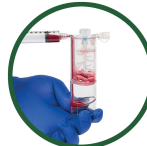
Pro-Stride Injection™ ACT-Protein Solution (anti-inflammatory w/ IRAP)

Point-of-Care Regenerative Medicine ACT™ - Autologous Cellular Therapy Tendons-Ligaments-Joints-Wounds